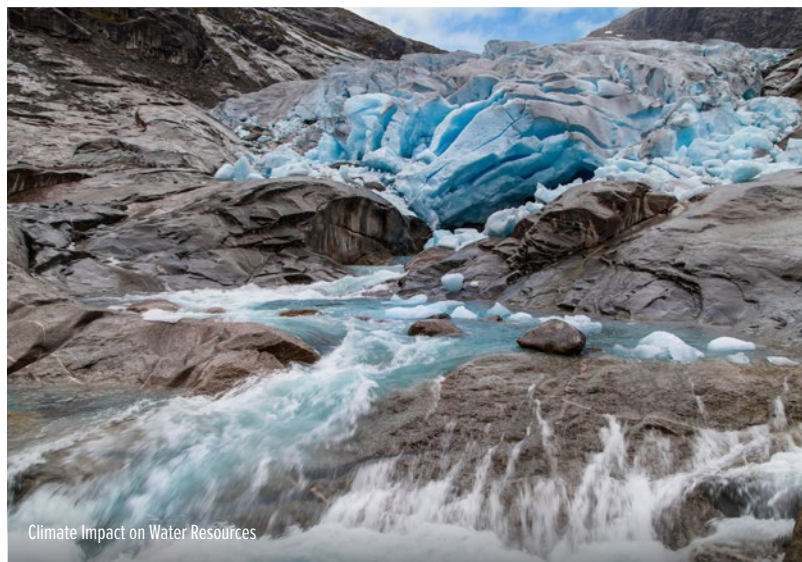
Climate Impact on Water Resources