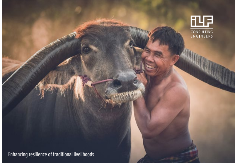
Enhancing resilience of traditional livelihoods