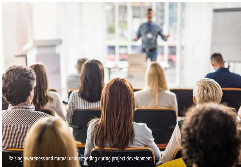
Raising awareness and mutual understanding during project development