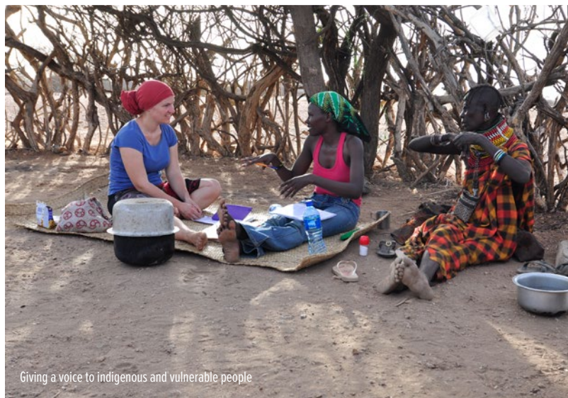
Giving a voice to indigenous and vulnerable people