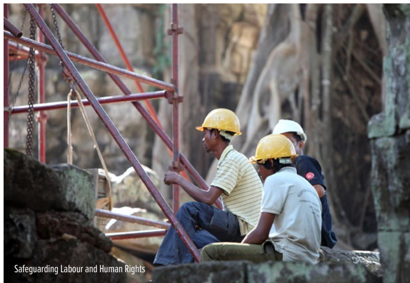
Safeguarding Labour and Human Rights