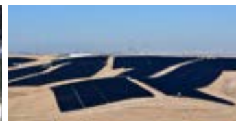
Photovoltaic power plant for refugee camp