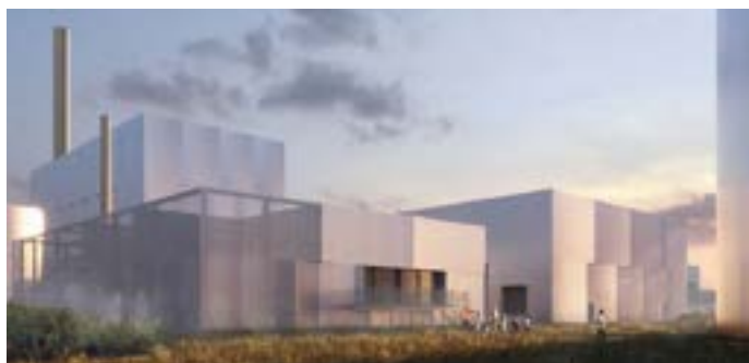
50MWT district heating plant Esbjerg