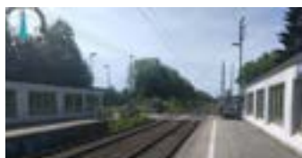
Expansion of the Daglfing - Johanneskirchen rail line