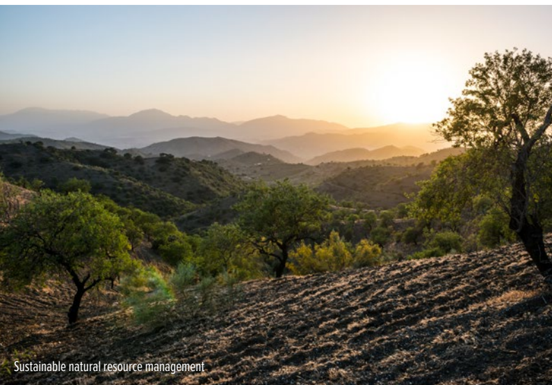
Sustainable natural resource management