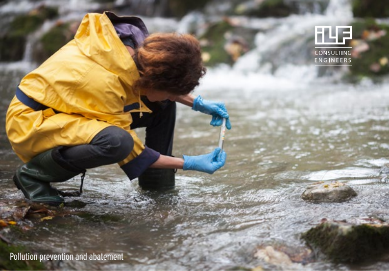
Pollution prevention and abatement

Being internationally committed and locally dedicated, ILF offers comprehensive, cross-disciplinary environmental services and valued support throughout project life cycles. Thus, for all of its engagements, ILF devises bespoke solutions that satisfy current goals and safeguards the needs of future generations.