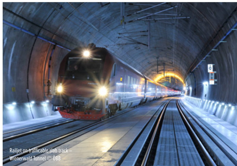
Railjet on trafficable slab track – Wienerwald Tunnel