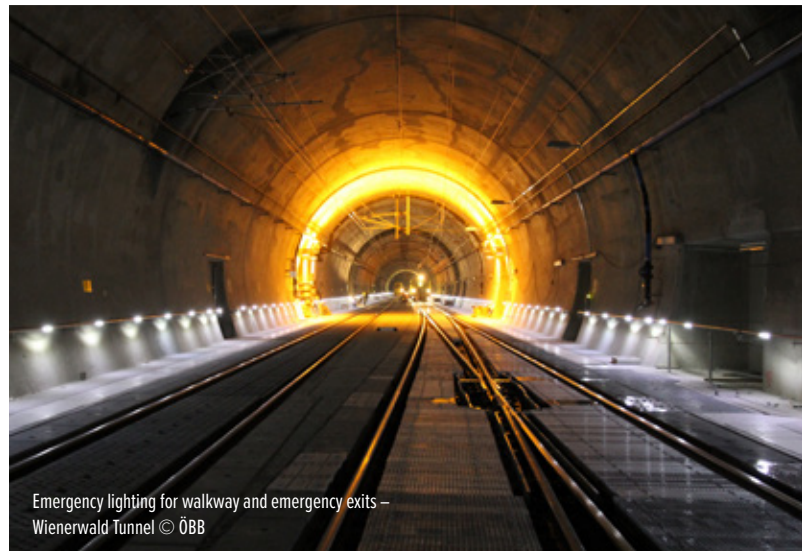
Emergency lighting for walkway and emergency exits – Wienerwald Tunnel