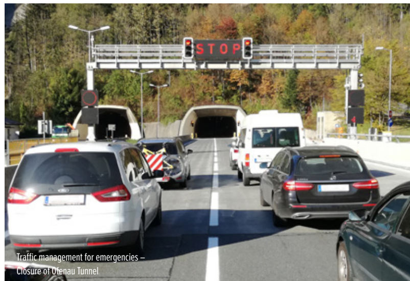
Traffic management for emergencies – Closure of Ofenau Tunnel