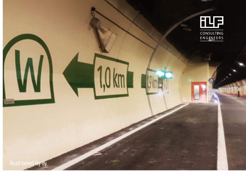
Road tunnel lay-by