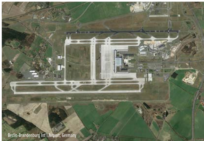
Berlin-Brandenburg Int'l Airport, Germany