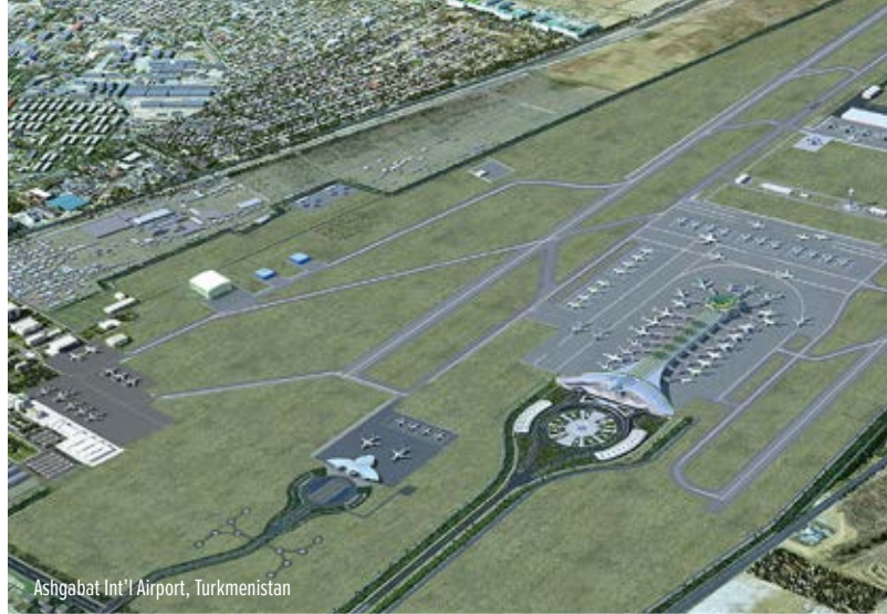
Ashgabat Int'l Airport, Turkmenistan