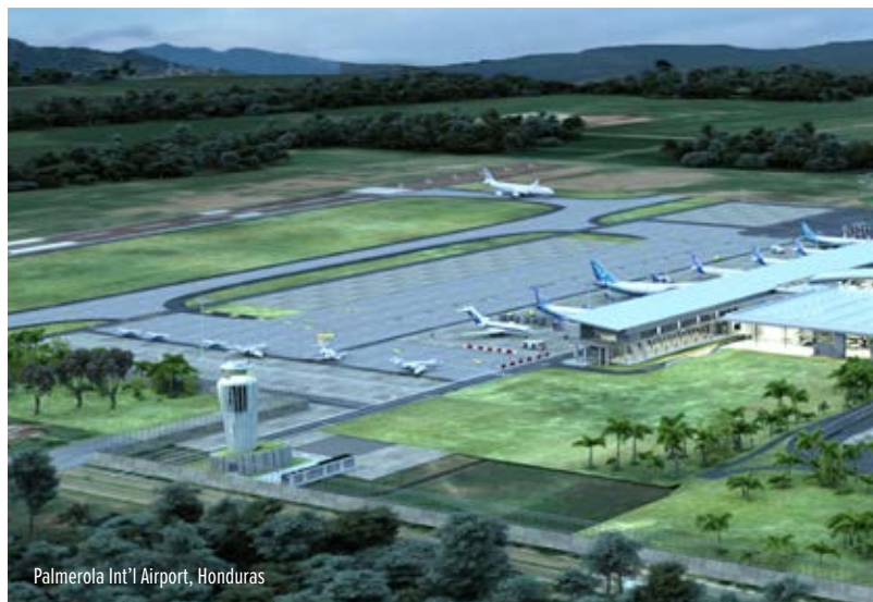
Palmerola Int'l Airport, Honduras