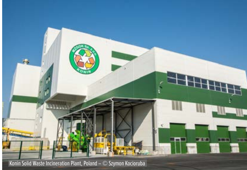
Konin Solid Waste Incineration Plant, Poland