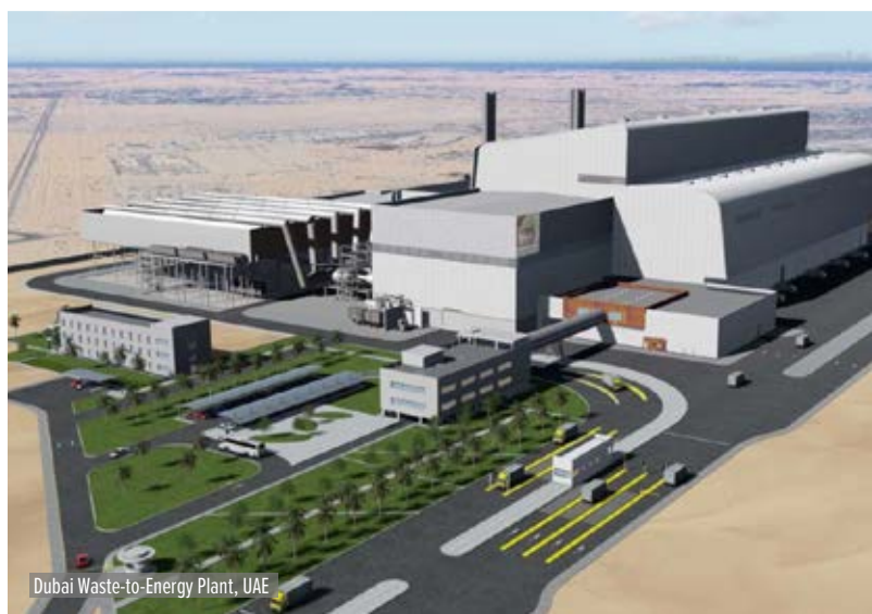
Dubai Waste-to-Energy Plant, UAE