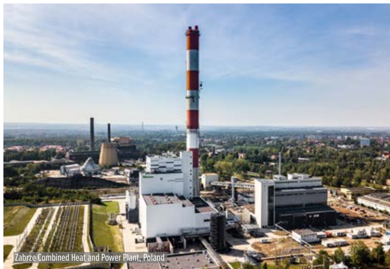
Zabrze Combined Heat and Power Plant, Poland