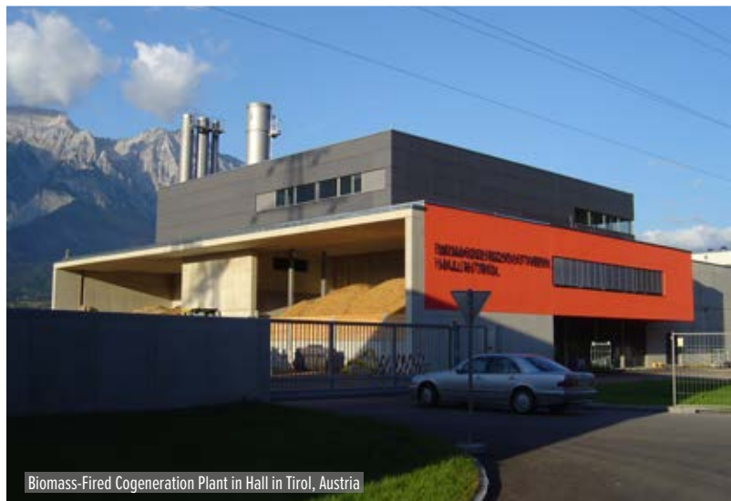
Biomass-Fired Cogeneration Plant in Hall in Tirol, Austria